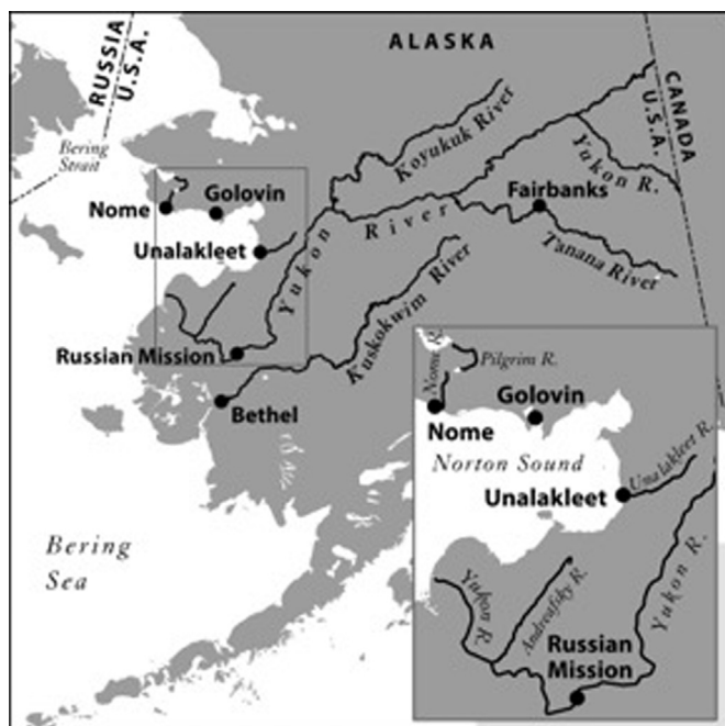
Fig. 1. Study area.

fisheries management accompanied by recommendations for this integration (Figs. 1 and 2).